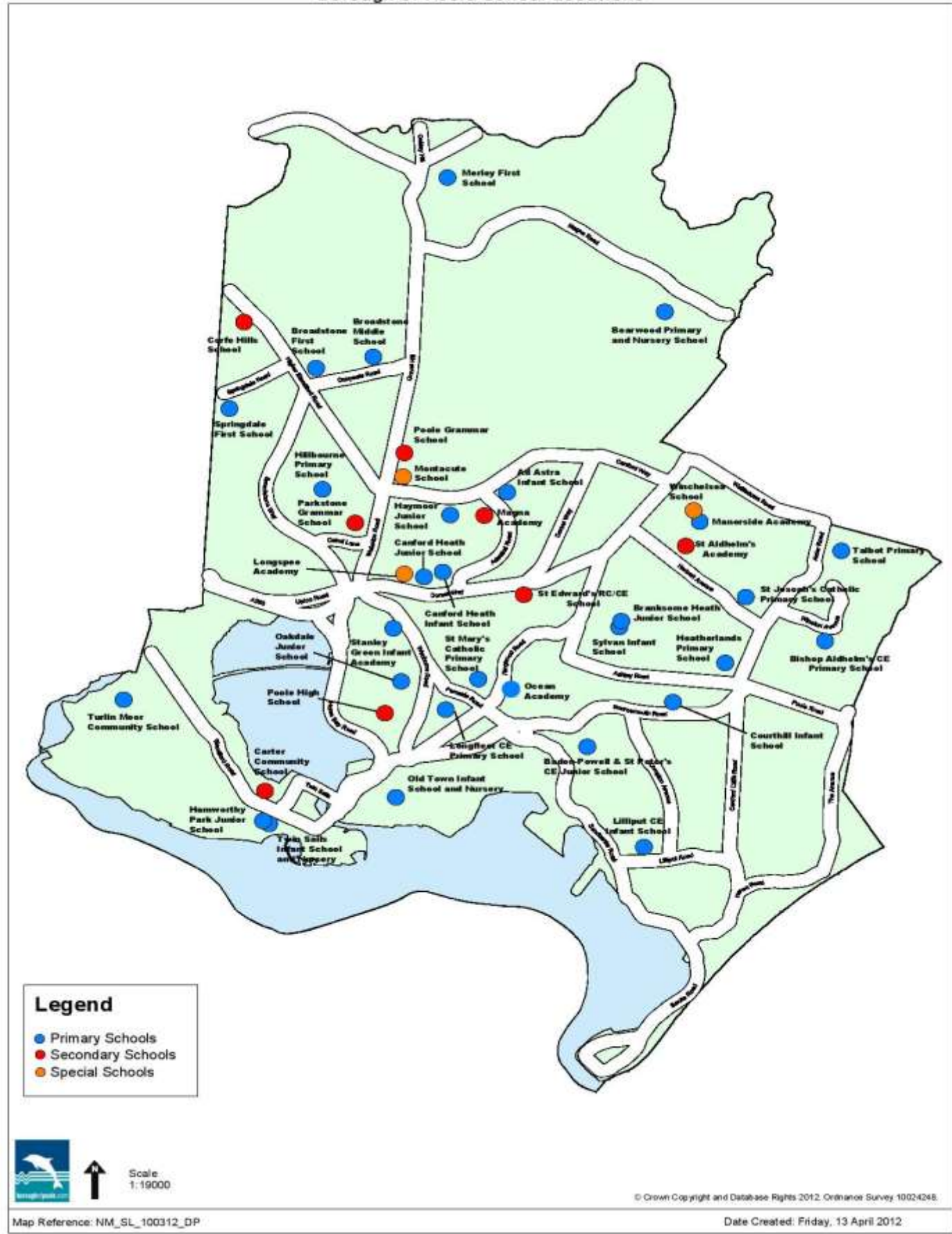
Borough of Poole School Locations

Contact the School Admissions Team on 01202 261936 or visit www.poole.gov.uk/schooladmissions